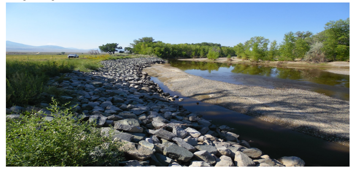
MCR 048 Emergency Repair Work

The Dayton Valley Conservation District has received funding to perform critical repair projects along the Middle Carson River 048 (along the Minor Ranch Property) and Middle Carson River 049 (along Fort Churchill Road and Buckland Ditch). The projects aim to restore eroding river bank and prevent future damage to infrastructure in the area. Emergency repairs were conducted in February, 2017 to stabilize the project on the Minor Ranch, which had severely eroded. The repairs were completed prior to the February flood, and appear to have held up well during that flood event, as well as during the spring runoff. The project along Fort Churchill Road is a large and expensive project. The project is planned for completion in the fall of 2017. RO Anderson Engineering recently conducted surveys of both project sites to determine the degree of damage caused by the January and February floods, as well as the prolonged spring runoff. Currently budgets and priorities are being evaluated to determine if one or both projects will be completed in 2017, or if some funds might be averted to more critical places damaged by the flood. The district is grateful for a variety of funding sources to complete the project: Nevada Department of Environmental Protection 319h program, Carson Water Subconservancy District, Lyon County, Nevada Division of State Parks, Nevada Department of Water Resources and RO Anderson Engineering.