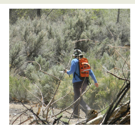
Crew mapping and spraying treatment areas

DVCD was also able to work with Storey County on noxious weed treatments and inventory. District crews have seen significantly diminished infestations of noxious weeds in 6 and 7 Mile Canyons, Gold Hill, and Virginia City because of annual treatments.