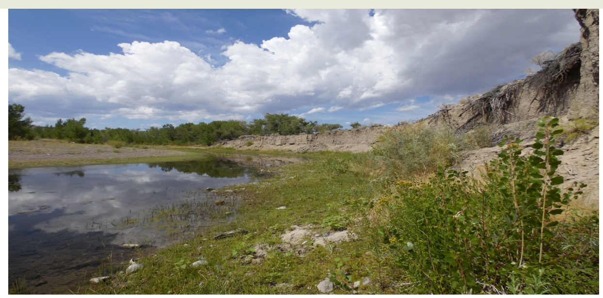
MCR 049 and visible bank erosion

The Dayton Valley Conservation District has received funding to perform critical repair projects along the Middle Carson River 048 (along the Minor Ranch Property) and Middle Carson River 049 (along Fort Churchill Road and Buckland Ditch). The projects aim to restore eroding river bank and prevent future damage to infrastructure in the area. Emergency repairs were conducted in February, 2017 to stabilize the project on the Minor Ranch, which had severely eroded. The repairs were completed prior to the February flood, and appear to have held up well during that flood event, as well as during the spring runoff. The project along Fort Churchill Road is a large and expensive project. The project is planned for completion in the fall of 2017. RO Anderson Engineering recently conducted surveys of both project sites to determine the degree of damage caused by the January and February floods, as well as the prolonged spring runoff. Currently budgets and priorities are being evaluated to determine if one or both projects will be completed in 2017, or if some funds might be averted to more critical places damaged by the flood. The district is grateful for a variety of funding sources to complete the project: Nevada Department of Environmental Protection 319h program, Carson Water Subconservancy District, Lyon County, Nevada Division of State Parks, Nevada Department of Water Resources and RO Anderson Engineering.